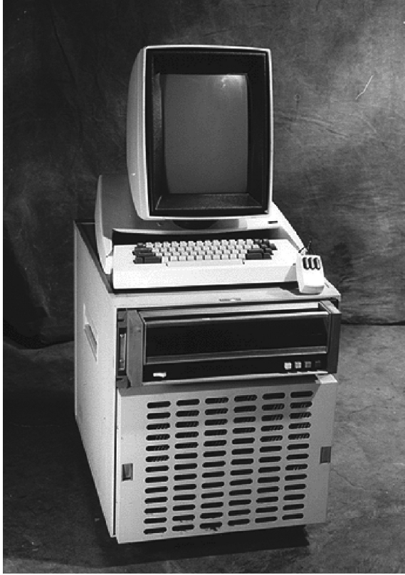
FIGURE 1.12.6 The Xerox Alto was the primary inspiration for the modern desktop computer. It included a mouse, a bit-mapped scheme, a Windows-based user interface, and a local network connection.

number that were donated to universities. Among the technologies incorporated in the Alto were: