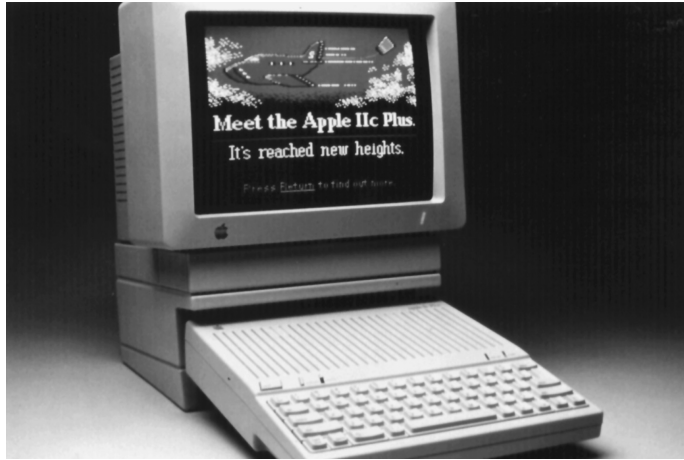
FIGURE 1.12.5 The Apple IIe Plus. Designed by Steve Wozniak, the Apple IIe set standards of cost and reliability for the industry.