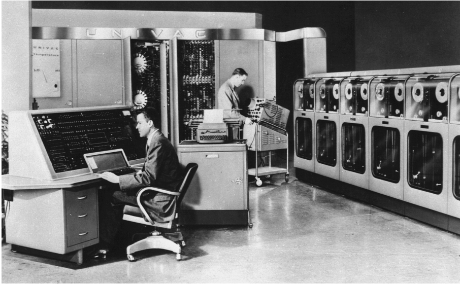
FIGURE 1.12.2 UNIVAC I, the first commercial computer in the United States. It correctly predicted the outcome of the 1952 presidential election, but its initial forecast was withheld from broadcast because experts doubted the use of such early results.

Computer), designed to be sold as a general-purpose computer (Figure 1.12.2). Originally delivered in June 1951, UNIVAC I sold for about $1 million and was the first successful commercial computer—48 systems were built! This early machine, along with many other fascinating pieces of computer lore, may be seen at the Computer History Museum in Mountain View, California.