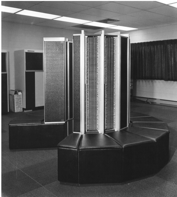
FIGURE 1.12.4 Cray-1, the first commercial vector supercomputer, announced in 1976.

In 1963 came the announcement of the first supercomputer . This announcement came neither from the large companies nor even from the high-tech centers. Seymour Cray led the design of the Control Data Corporation CDC 6600 in Minnesota. This machine included many ideas that are beginning to be found in the latest microprocessors. Cray later left CDC to form Cray Research, Inc., in Wisconsin. In 1976, he announced the Cray-1 (Figure 1.12.4). This machine was simultaneously the fastest in the world, the most expensive, and the computer with the best cost/performance for scientific programs.